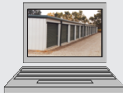
We use the latest in design and estimating software